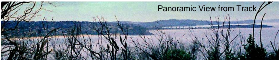
Panoramic View from Track