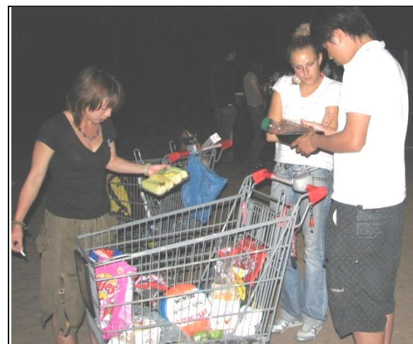
Groups arrive with shopping trolleys throughout the night, full of food and alcohol, and leave them behind.

Last month we showed photos of rubbish left at Shelly beach. This month there have been complaints from rate payers unable to get on BBQs, while groups and individuals stay cooking till late, leaving debris behind.