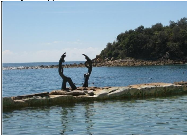
Fairy Bower Pool - sculpture & snorkelers beyond.

Our Annual General Meeting is to take place this month - at 7:30pm in the Manly Surf Lifesaving Club on Monday 7 April. I will be stepping down from the Chair and all other positions will be declared vacant. There are indications that several people, including past and present office bearers, will allow themselves to be nominated so PLEASE come along to offer your support and to vote.