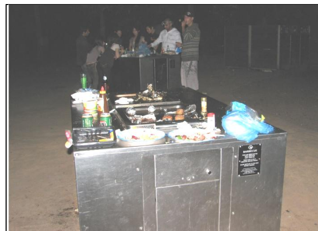
Abandoned BBQs left like this, make it impossible for others to use.

Please send any photos and complaints to: munro.communications@bigpond.com